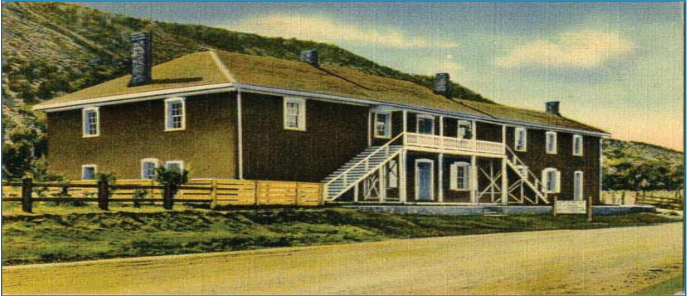
Carrizozo, New Mexico

Lincoln County is in central New Mexico among mountainous terrain and sprawling basins. The county was using outdated technology to manage their GIS data and looked to standardize their GIS on an Esri platform to ensure a more stable environment for their GIS information. Sidwell reviewed existing parcel maintenance workflows to determine optimal processes. Additionally, a data model needed to be designed to best fit the needs of the county. Sidwell recommended a path to modernize the county's GIS revolving around Esri's Local Government Information Model (LGIM) and the parcel fabric.