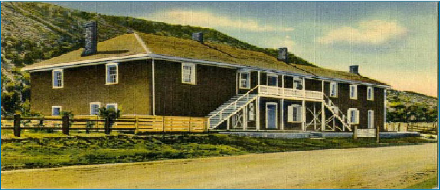
Carrizozo, New Mexico

Lincoln County is in central New Mexico among mountainous terrain and sprawling basins. The county was using outdated technology to manage their GIS data. The county looked to standardize their GIS on an Esri platform to ensure a more stable environment for their GIS information. Sidwell reviewed existing parcel maintenance workflows to determine optimal processes. Additionally, a data model needed to be designed to best fit the needs of the county. Sidwell recommended a path to modernize the county's GIS revolving around Esri's Local Government Information Model (LGIM) and the parcel fabric .